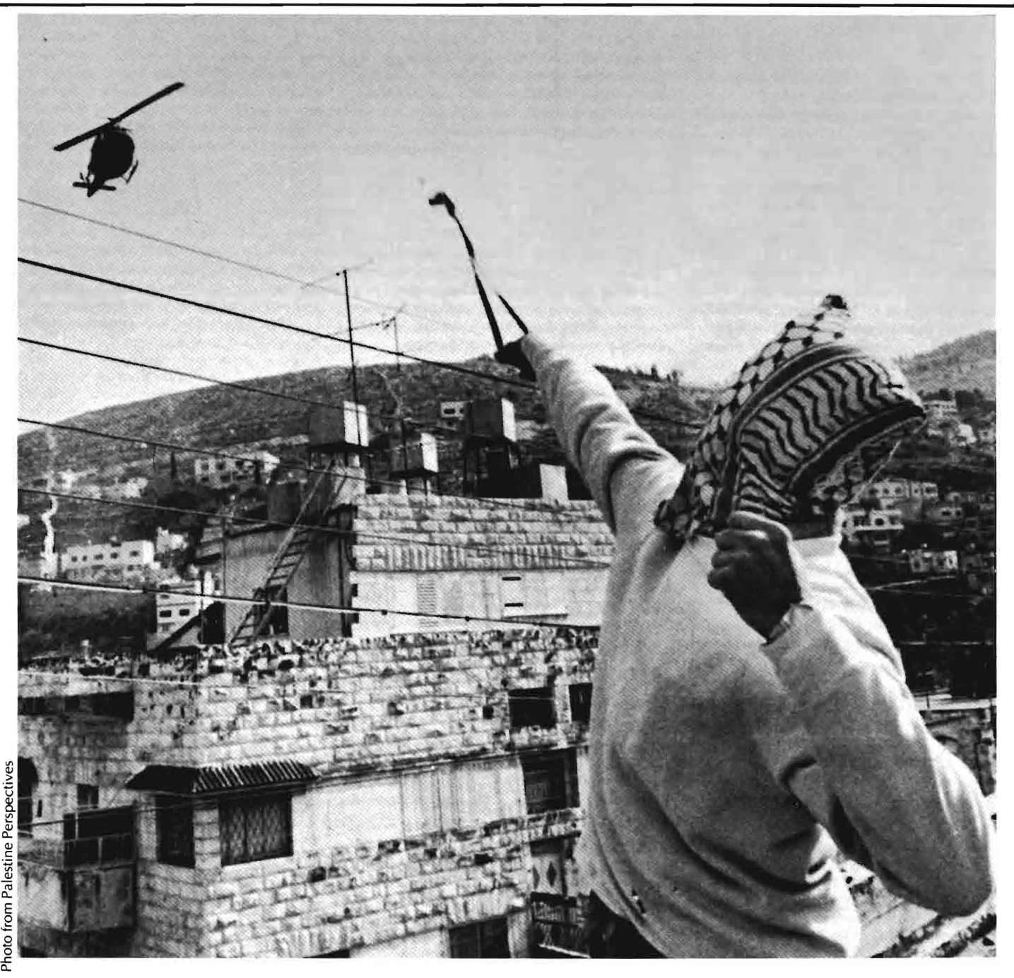
LATE 20th CENTURY ROLE REVERSAL Palestinian David Zings Jewish Goliath