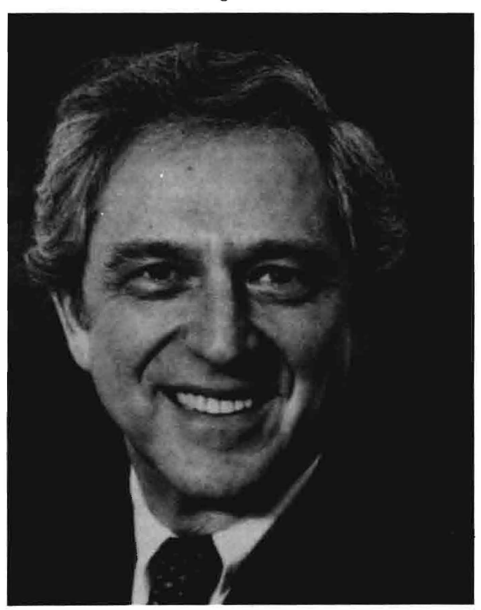
Dr. Edward Bloustein

Canada and Britain already have racial restrictions on free speech. Bloustein's new policy could be a trial balloon for future national policy in America. If university students can accept such limitations on freedom of expression in 1988, then perhaps the nation as a whole will be cowed by the time 1998 comes along.